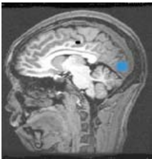
Figure 2 fMRI image shows comparison of normalized blood oxygen level-dependent responses between AND & control conditions during visual task. Blue voxels are greater in AND condition.